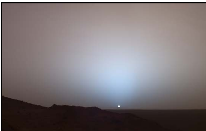
Sunset over Gusev Crater (acquired by Spirit ).